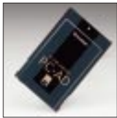
PC Card Adapter PC-AD