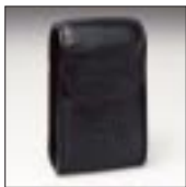
Soft Case SC-DX5