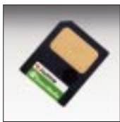
SmartMedia™ Cards MG-2 (2MB) MG-4 (4MB)