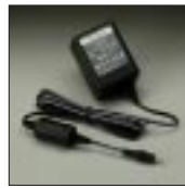
AC Power Adapter AC-3V