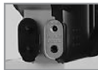
The slanted photos on these pages were taken with the DX-5.