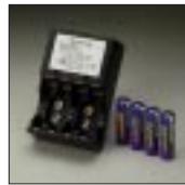
Battery Charger with Battery BK-68PF